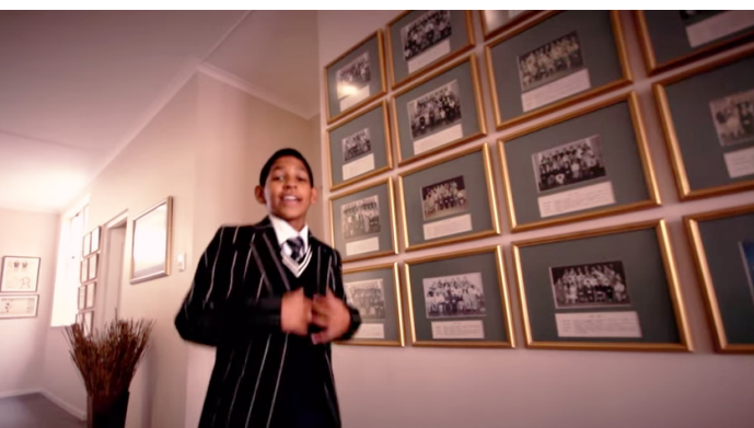
Selborne made their announcement with a YouTube video that picked up press coverage. Check it out here: <a href="http://goo.gl/qdBfah">http://goo.gl/qdBfah</a>